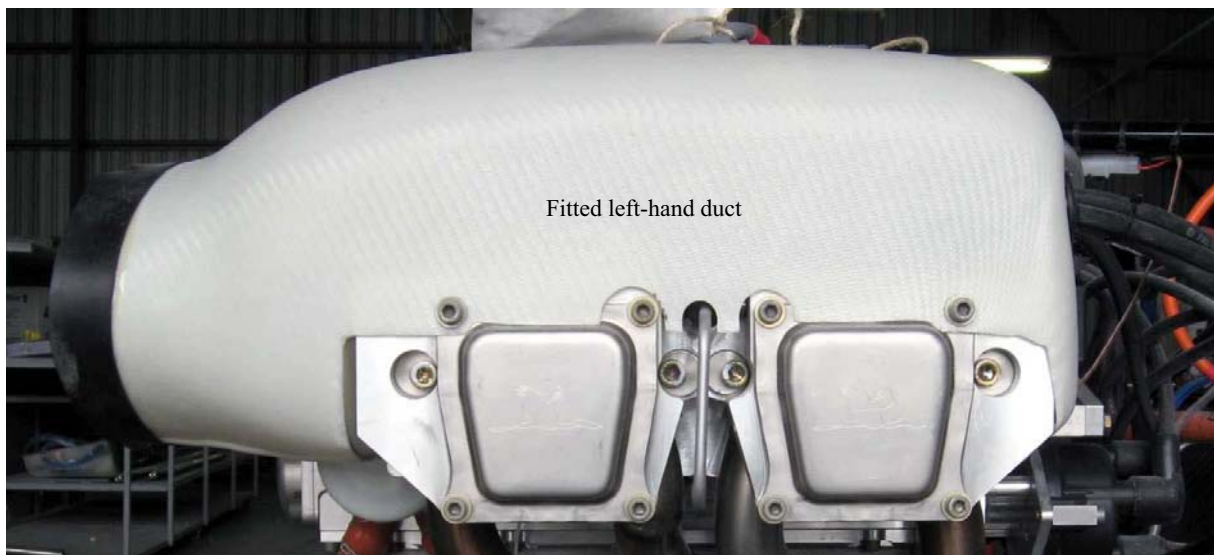
Fitted left-hand duct

The spring may be unhooked at the bracket end to remove the duct.