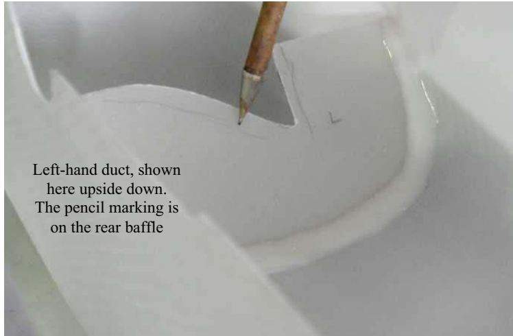
Left-hand duct, shown here upside down. The pencil marking is on the rear baffle